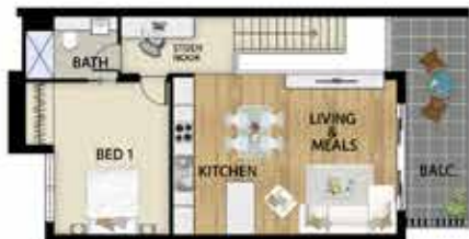
TH 1 FIRST FLOOR