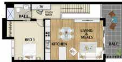
TH 2 FIRST FLOOR