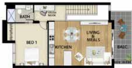
TH 3 FIRST FLOOR